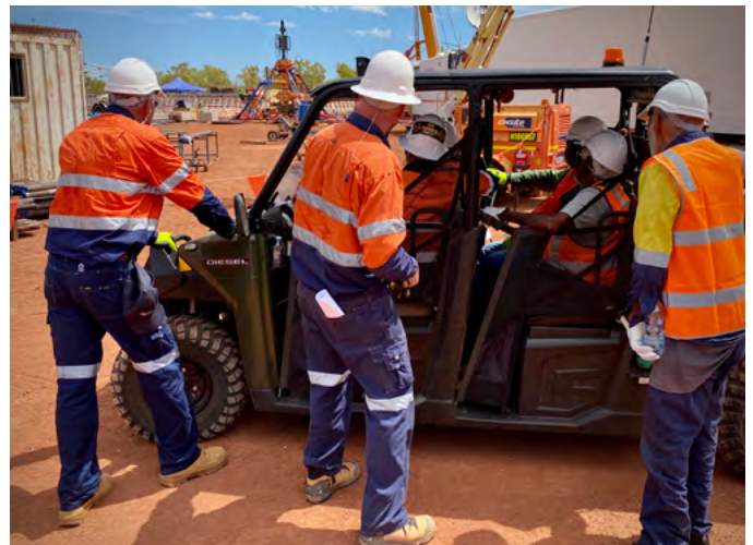
Native Title holders with Origin personnel at Kyalla during fracture stimulation (September 2020)