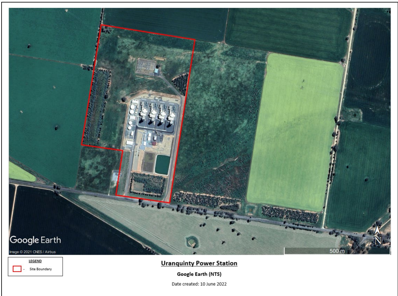
Figure 3.1 Site Location Plan – Uranquinty Power Station