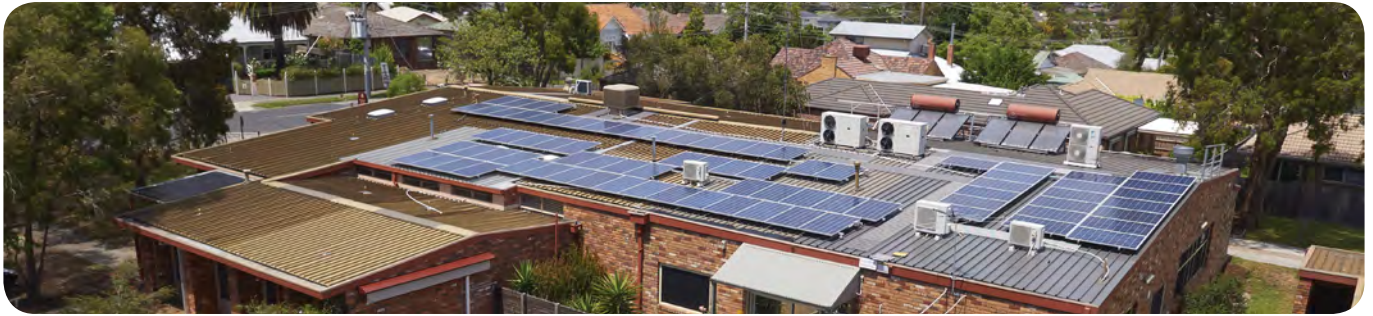
28.5kW Solar system installed at Olympic Leisure Centre