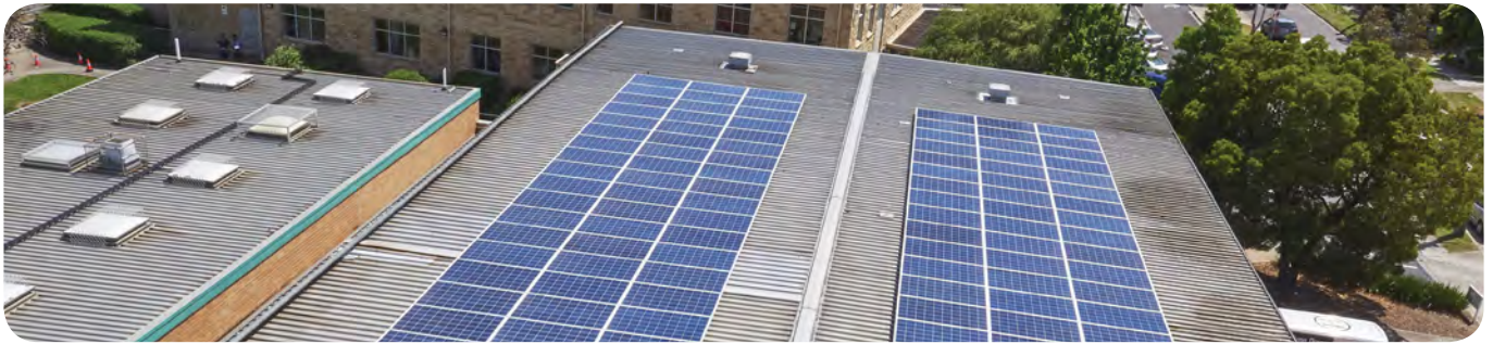
20kW Solar system installed at Home & Community Care Delivered Meals Service

“As a city council, we are always looking for ways to become more environmentally friendly. With the cost of going solar being so reasonable and affordable, it was an easy decision. We are looking forward to seeing our bills go down.”