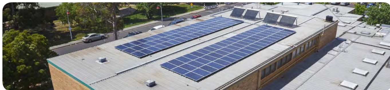
28.5kW Solar system installed at Olympic Leisure Centre