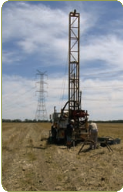
Survey and testing carried out on the proposed power station site to assist with developing the technical specification for the tender process.