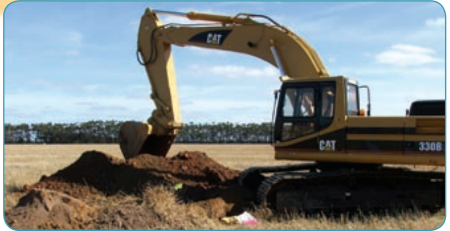
Local Mortlake excavation contractor undertaking soil testing work on the proposed power station site.

This is the fifth in a series of project newsletters and the first for 2006. Our goal is to keep you informed of Origin Energy's progress in gaining approvals for the proposed gas-fired power station 12km west of the township of Mortlake (with a nominal capacity of 1000MW) and a 78km gas pipeline from near Port Campbell to the proposed site.