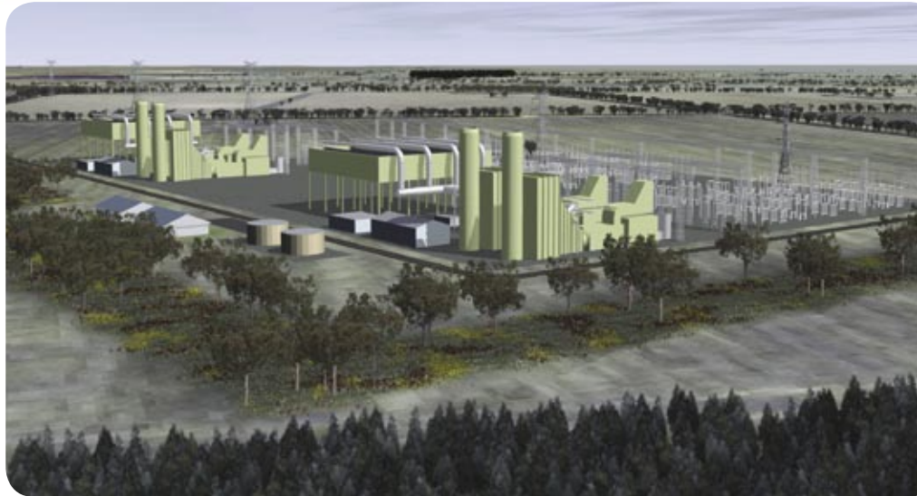
Artist's impression of the proposed Mortlake Power Station

Our goal is to keep you informed of Origin Energy's progress in gaining approvals for the proposed gas-fired power station 12km west of the township of Mortlake (with a nominal capacity of 1000MW) and a 78km gas pipeline from near Port Campbell to the proposed site.