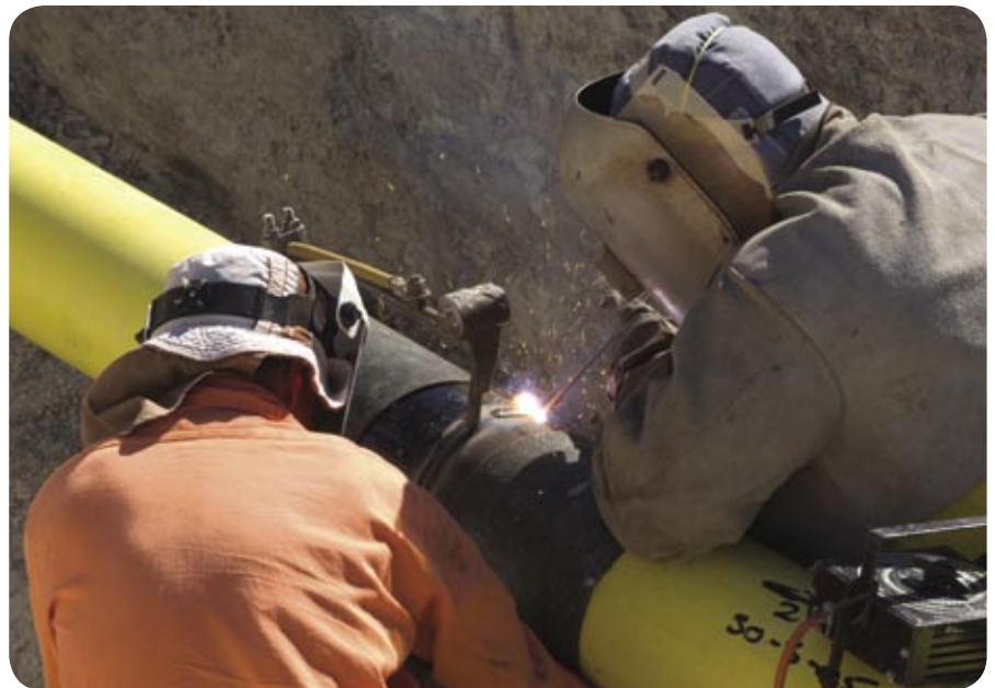
Businesses and individuals can register their interest for work online

These details will be supplied to the main construction contractor, when selected, for use at its discretion.